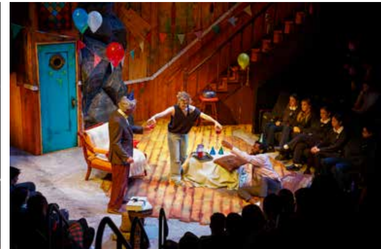
Dedicated Schools Performance, MR BAILEY'S MINDER (2023)