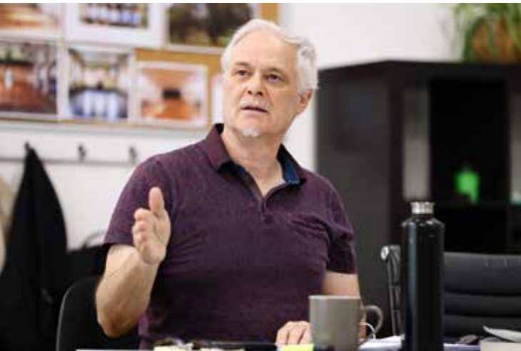
MCGUFFIN PARK Rehearsal (2024)

Feel free to drop by the theatre and bring us your form