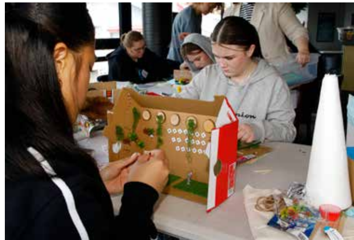
SmArt Workshop Week (2024)