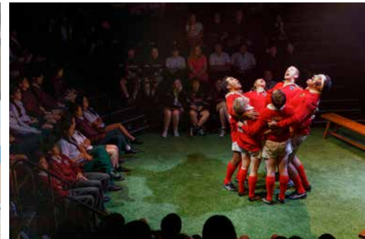
Dedicated Schools Performance, ALONE IT STANDS (2024)