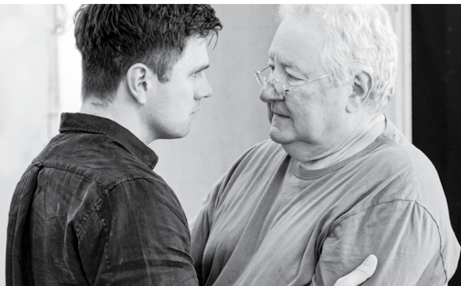
Rehearsal Images