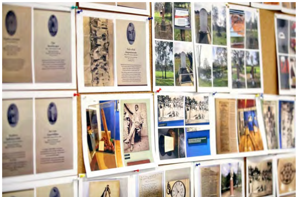
Mood board inside the rehearsal room for BLACK COCKATOO

Activity 4: BLACK COCKATOO explores the importance of ownership of story, history and knowledge. Brainstorm with your students how the non – linear narrative structure enhances the exploration of our first issue and concern – the importance of truth in Australia's historical narrative.