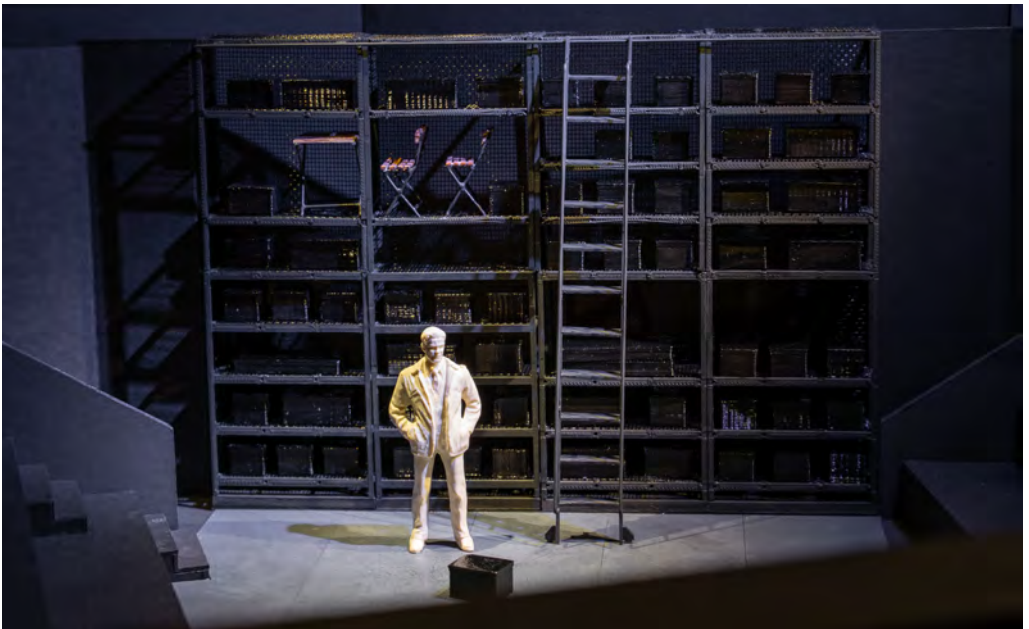
Set design for BLACK COCKATOO by Richard Roberts

With costumes it needed the same approach. With the exception of the actor playing Johnny Mullagh who only plays him, every other actor plays multiple roles sometimes changing in seconds. So we decided to place the actors in neutral black clothes from the contemporary story but with details that support each of their contemporary characters (they are after all four people breaking into a museum hoping to avoid detection! They even have black balaclavas). Then when they take on the character of one of the figures from the nineteenth century, it's simply a matter of adding an item of period clothing that might have some colour in it allowing it to 'pop' out from the black.