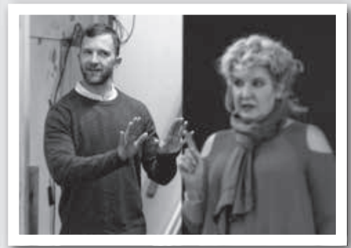
REHEARSAL PHOTOS BY PRUDENCE UPTON