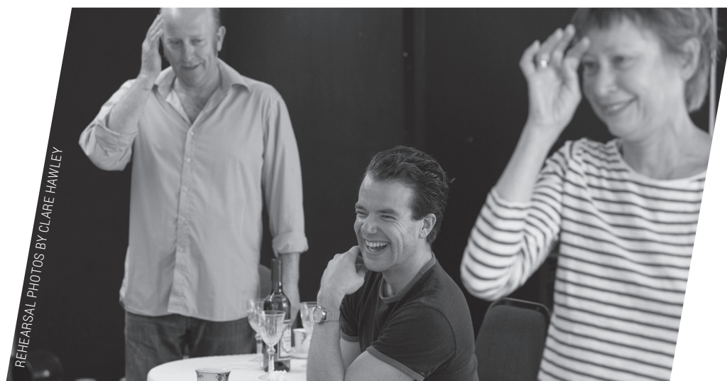
REHEARSAL PHOTOS BY CLARE HAWLEY