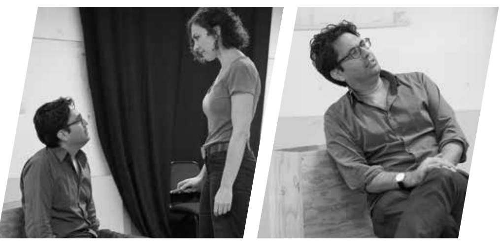
Ensemble theatre for everyone